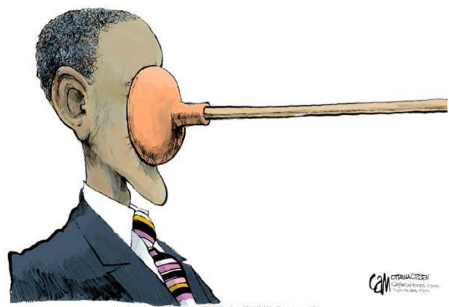
BARACK OBAMA MEETS JOE THE PLUMBER

And the he said, "redistribution of wealth is good for everybody."